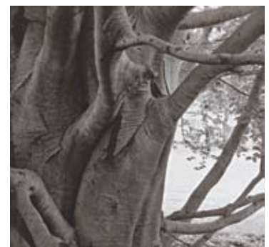
Gregory Conniff , American 1944- Purple Beech , Chapel Lawn Canadian Hemlocks , Amphitheater Veitch Fir, east of Strong House in the Pinetum Rhododendrons and a Norway Spruce , Center for Drama and Film Canadian Hemlocks , Amphitheater Corkscrew Willow, reflected in Class of 2000 Hillspring Pond, near Sunset Lake Thompson Library , Sugar Maples, great London Plane Tree, 'Legacy' Sugar Maple Canadian Hemlocks, Eastern White Pines and Norway Spruce , Noyes Garden Porcelain Berry growing from a White Willow , Priscilla Bullitt Collins '42 New York Ferns and Canadian Hemlocks , Amphitheater Eastern White Pine foreground, and Purple Beech background , Chapel Lawn